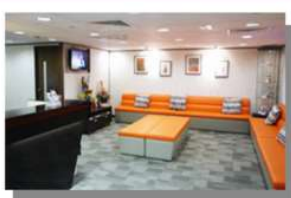
Causeway Bay (Hong Kong Island)