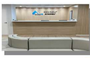
Yuen Long (New Territories West)