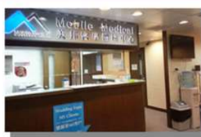
Tsuen Wan West (New Territories)