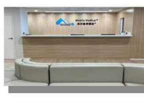
Yuen Long (New Territories West)